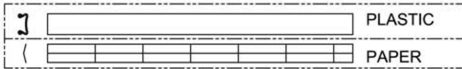
LABEL & HOLDER DETAIL