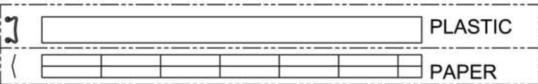
LABEL & HOLDER DETAIL